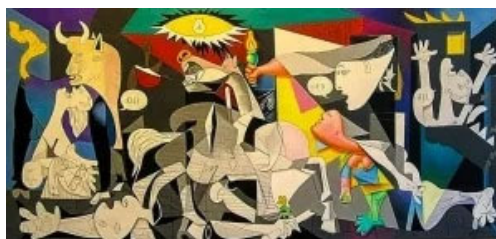
Pablo Picasso's Guernica , 1937

World War 2 was followed by wars in Hiroshima/Nagasaki, Korea, Vietnam, Cambodia, Laos, the Near East/Palestine (8 wars), Iraq, Iran, Afghanistan, Libya, Ukraine, Yemen, and Gaza, to name but a few. And in each of these wars massive bombings and aerial bombardment have been the weapon of choice, resulting in the death of millions of human beings.