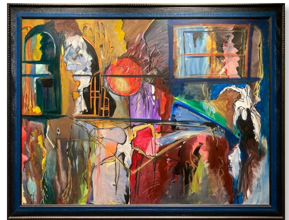
This Wasan Hammadi painting brightens our living room.

all with fantastic ensembles and performances. Streaming concerts on TV is wonderful.